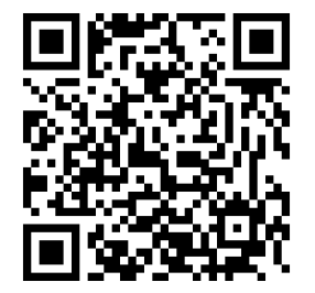
Scan the QR code to submit your contribution proposal